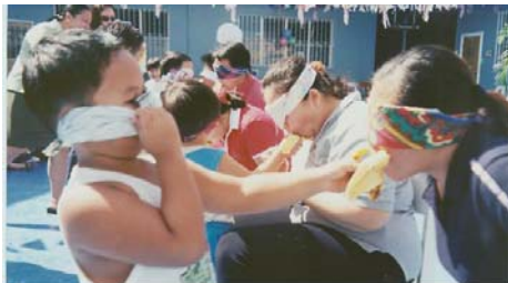
I want my mom to be the winner.

ISA Preschool Sportsfest and Field Demo was held last August 27. ISA indeed provides a promising future to the ISAers not only in academics but also in other extra curricular activities that help unlock children's hidden talents.