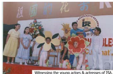
Witnessing the young actors & actresses of ISA.