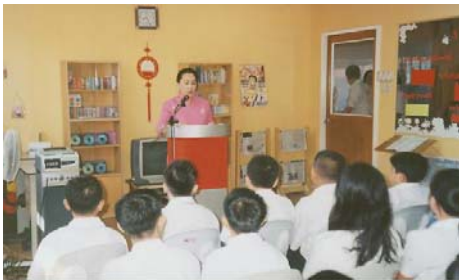
Speaking Before Grade IV - 1st Year Students On The Virtue Of Sharing

Iloilo Scholastic Academy kicks off the Moon Festival Day, Confucius Day, International Literacy Day and ISA Day celebration with a motorcade. The participants of the parade include the board members, parents, faculty, staff and students. They assembled at the Gaisano City parking ground at 1 p.m. and started to move along the major thoroughfare in the city an hour later. All the cars were decorated with creative streamers and colorful balloons. Clifford, the Scholastic Big Red Dog, easily became one of the main sensations of the said event. (PSE)