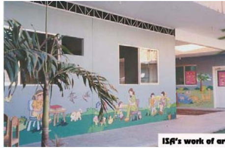
ISA's work of art

“Impressions made through the senses are more vivid and lasting.”