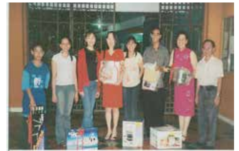
The Eight Lucky Finalists During The Mid- Autumn Festival Dice Game

The most exciting part was the dice game of the children. Others were hesitant at first to join but as they went through playing, they felt the excitement of the game. There were prizes given to motivate the kids. Everyone got the chance to play and feel the essence of the Moon Festival, which was totally a new experience for most of them.