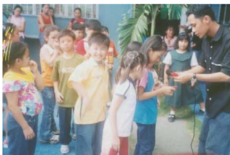
Grade 2 pupils are all set for another exciting game

Though a lot of food were shared, many gifts were given and received, and games and prizes that made the children enjoy the party, still...we did not lose sight of the true essence of this occasion: that it is all about sharing of what we have and loving one another... (OBJ)