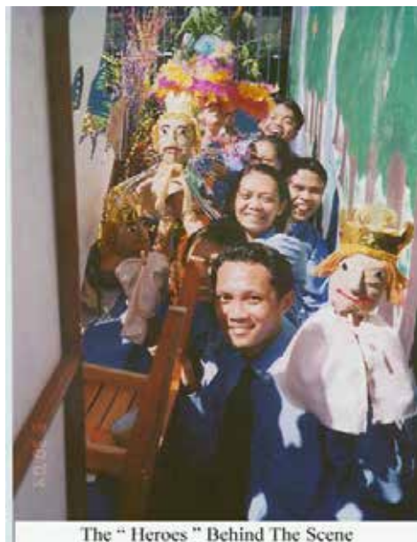
The "Heroes" Behind The Scene