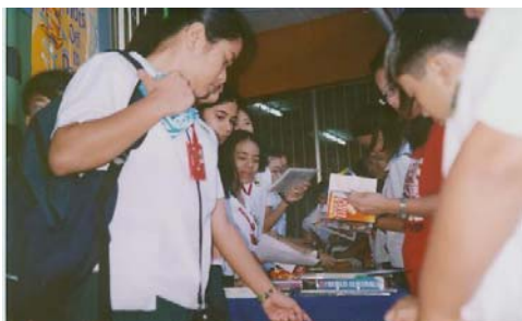
ISA Student Council Sponsors Scholastic Book Fair

Last September 30, the ISA Student Council sponsored a book fair inside the campus. It was really a great moment when you could see dozens of books which you can hardly find in the bookstores. Actually, ISAers were looking forward to the book fair. Many of them bought books even when the ISA-SC officers were starting to display the books very early in the morning. The ISA book fair was not only about selling of books. While the selling was going on, there were presentations, stage plays, and quiz bees to help develop students' awareness of literature and art. And those were not all...If you buy a book, you could have a chance to take picture with Clifford, the Scholastic's big red dog, at a discounted price! Of course, I was one of the ISAers who bought many books for myself. Scholastic books are really great! They could be for adults and for kids like me. The ISA Book fair was an eye opener for many who had just discovered the immense wealth contained in books. Even for this reason alone, I should say the book fair was a great success. So c'mon dear, Drop Everything And Read! (ES)