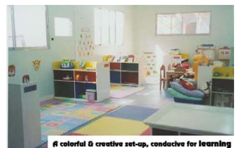
A colorful & creative set-up, conducive for learning

The success of ISA's ongoing Summer Camp is another proof of its continuing quest for excellence. (AME)