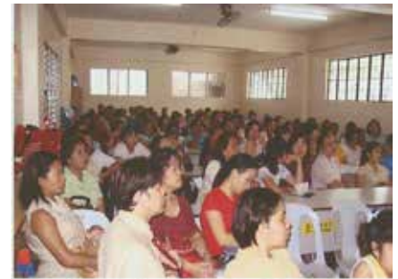
Parents listening attentively to the Executive Director.

ISA believes that parents' involvement on their children's education is very important in the realization of the vision and mission of the academe. Thus, ISA conducted its 1 st Parents' Orientation Program last June 6, 2004.