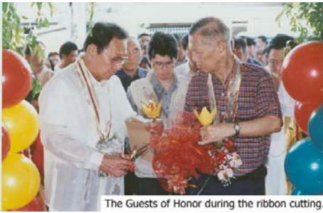
The Guests of Honor during the ribbon cutting.

Guests and participants gathered together for the most awaited day of Iloilo Scholastic Academy, the Inauguration and Blessing of ISA, which was held last May 15. It started with a motorcade at 1 pm.