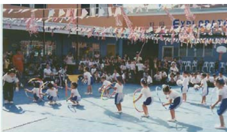
A Glimpse of pre-school field demo.

Harnessing the bonding between parents and child was the main theme of this undertaking. Parents excitingly took part in the games was the highlight of the half-day activities. Parents actively joined in the Parlor Games such as: ISAers Went to Town, Water Relay, Pabitin, Tricycle Race, Hitting the Pot and Big Mouth Says, among others.