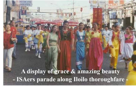
A display of grace & amazing beauty - ISAers parade along Iloilo thoroughfare -