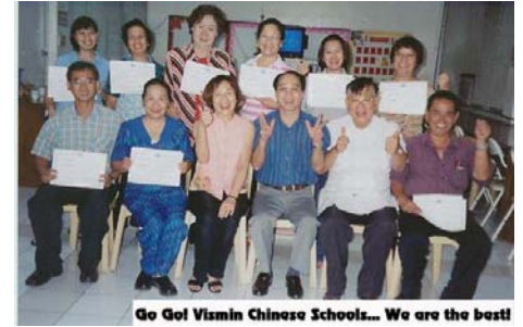
Go Go! Vismin Chinese Schools... We are the best!