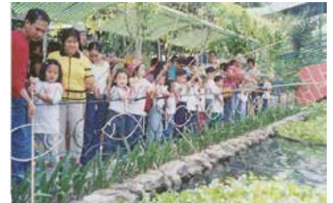
The Kinder Pupils enjoy catching fish

"On the first day of school everybody, including me, had first impression with people whom we didn't know yet. As days went by, we got to know each other better. First impression and relationship with other schoolmates have changed." -Fritzie