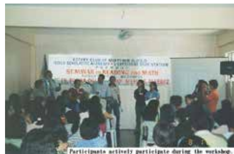
Participants actively participate during the workshop.