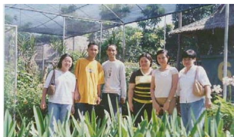
The Faculty in the blooming garden

We believe children would learn faster and better if we let them see things in real. Afterall, education should not be limited within the confine of the four walls. -PSE