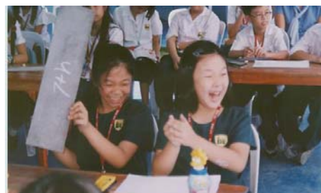
We've Got It Right!

This activity helps train ISAers to be prepared to withstand greater challenges they are going to face on their route to success... (MABF)