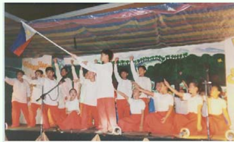
"Mabuhay Ang Pilipinas" Grade 5 Students Showcasing Their Talents

Active cooperation from every member is vital to team success. Team member cannot sit back and be a bystander while others actively render their services; teamwork facilitates cohesiveness and helps achieve common ends. Effective team is not just collections of individuals; rather, it forms a force that is greater than the sum of its parts. Thus team members must work together closely and make every effort to serve common cause.