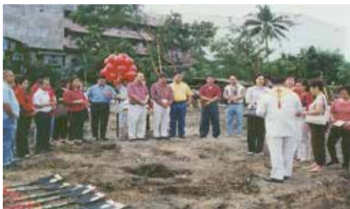
Reminiscence: Ground Breaking January 22, 2004

This year, members of the graduating classes of Grade Six and Pre-school will go up the stage to receive their diplomas on March 20. They will stand proud being the first graduates of ISA. Showing to everybody that they have done their best in academics, cultural and sports activities. To the graduating classes, strive hard! Move On! Aim High! Congratulations!