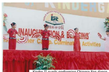
Kinder II pupils performing Chinese Fan dance.