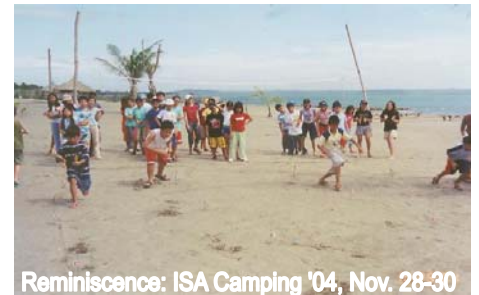
Reminiscence: ISA Camping '04, Nov. 28-30

The results greatly help the school and teachers identify areas of strengths and those that need further reinforcement. In general, the figures reveal that ISAers are relatively strong in English and Math; and need improvement in Science. Taken by level, the Preschoolers were the most prepared for the next academic level; followed by the Grades 1 to 4. Comparably, the incoming grade 3 class is excellent in English; and the incoming grade 6 is the best class when it comes to Mathematics. (OBJ)