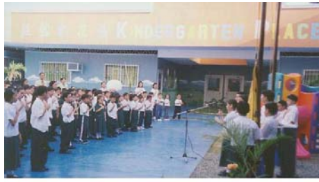
The Flag ceremony led by the Grade V-Shakespeare Students

This simple practice is a proof that cleanliness is an integral factor of ISA's well-crafted educational system. -ISL