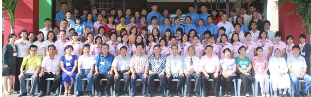
The Convention of the Association of the Visayas Chinese-Filipino Schools held on October 25-26 was co-hosted by ISA. 106 delegates from 11 member-schools attended the said convention. Photo taken after the opening ceremony.

The Monthly Newsletter of ISA 菲律賓怡朗新華學院通訊月刊