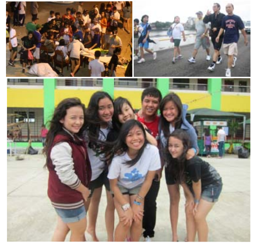
Clockwise from upper left: Registration at dawn; ISA parents on the go; ever active ISAers in front of the new school building declaring 'I Finished ISA Fun Run'.

Cruising the Jiuqu (Nine-curve) River that winds its way through the picturesque Wuyi Mountain National Park in northern Fujian, China. Fourteen ISAers joined the summer study camp held at Xiamen City in April to May this year. They belonged to the 7 th batch of ISA learners who took part in the 8-week long study and tour package jointly organized by the Tan Yan Kee Foundation and Philippine Chinese Education Research Center. Since its operation in 2004, ISA has been active in sending learners, 1 st and 2 nd years specially, to this annual event which helps polish their Mandarin.