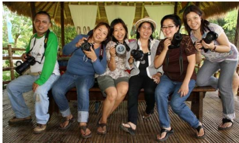
Parent-Learners would often explore places of interest looking for subjects to hone their skills in photography. We encourage more ISA parents to join their rank.