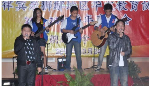
One of the ISA Bands, Chromatix, performed at the welcome banquet. Other learners from ISA, ICCHS and SYSHS also presented cultural numbers.