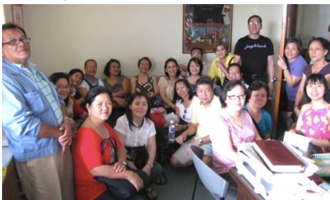
Batch 79 Alumni of Iloilo Central Commercial High School drove by ISA campus after having class reunion at Damires Hills Janiway on 26 February. They were warmly received by ISA Executive Director, who happens to be their batch mate.

Well said. But are there bottlenecks in the seemingly robust state of ISA education? Many are quick to point out that Chinese Language instruction and Physical Education have lagged behind other aspects of learning. Admittedly, in spite of ISA’s achievements, there remain quite a few issues need to be addressed. The lackluster in Chinese instruction and physical Education are just two prominent examples. Issue concerning how to maintain quality instruction is one strategic problem we need to face and resolve. Luckily, the past 8 years have given us enough confident, that these issues, no matter how formidable they may seem, can all be adequately resolved, in due time.