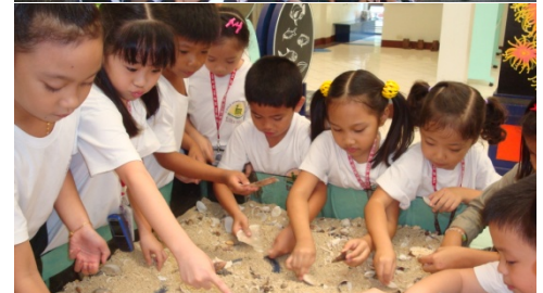
Kinder-2 learners visited a Taoist temple located at Brgy. Tanza on 3 February as part of their civics lesson. (above) For most of the children, that was their first time to visit such a worship place. Expectedly, they were curious of, and were fascinated by, the unfamiliar huge images of Taoist gods and goddesses at the altar. After that, they went to South East Asia Fisheries Development Center (SEAFDEC) in the town of Oton. The live sea animals as well as the large collection of specimen displayed on the shelves had aroused the curiosity of the children. They were specially thrilled to touch real sea shells at the interactive area. (below)