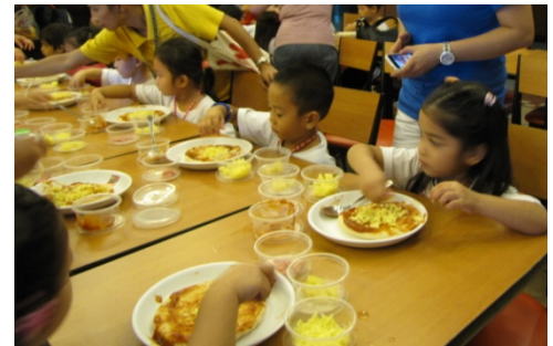
On 3 February, Kinder 1 (10) children went to Central Philippine University butterfly garden to have a close encounter with the colorful butterflies of various species. Their second stop was Shakey’s at SM City. There, they experienced the making of their own pizza. By following the step-by-step instruction, they eagerly put cheese, sausages, and other ingredients on the dough. For the first time, the children enjoyed the pizza they helped prepared.